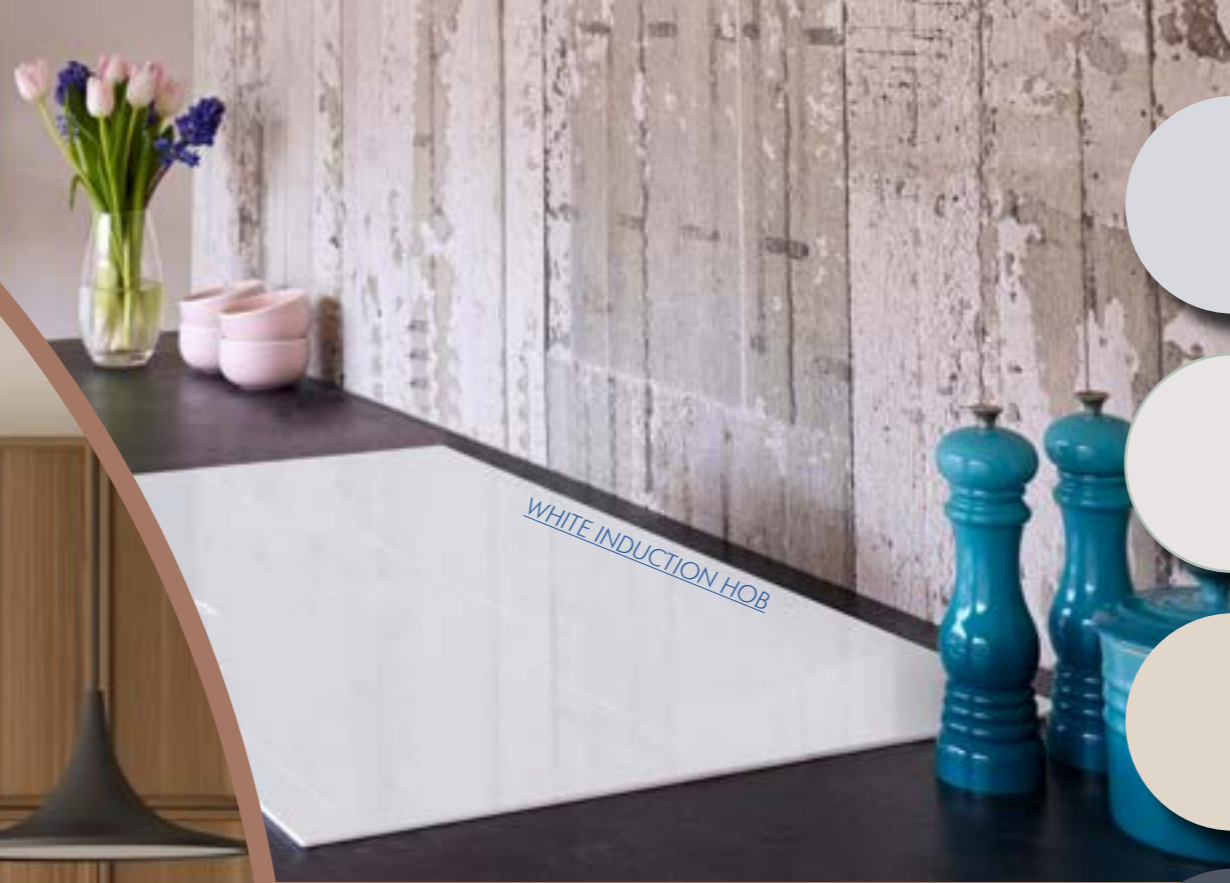
WHITE INDUCTION HOB