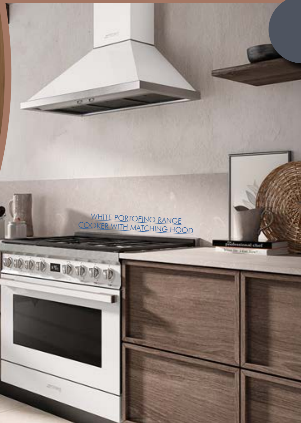
WHITE PORTOFINO RANGE COOKER WITH MATCHING HOOD