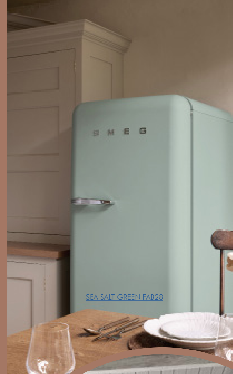
SEA SALT GREEN FAB28

Embodying the rich tones of the Mediterranean, Smeg's contemporary Portofino range cooker collection is inspired by the Ligurian harbour it's named after. The Olive Green and Blue colourways can be seamlessly added to compliment the richness of Mocha Mousse.