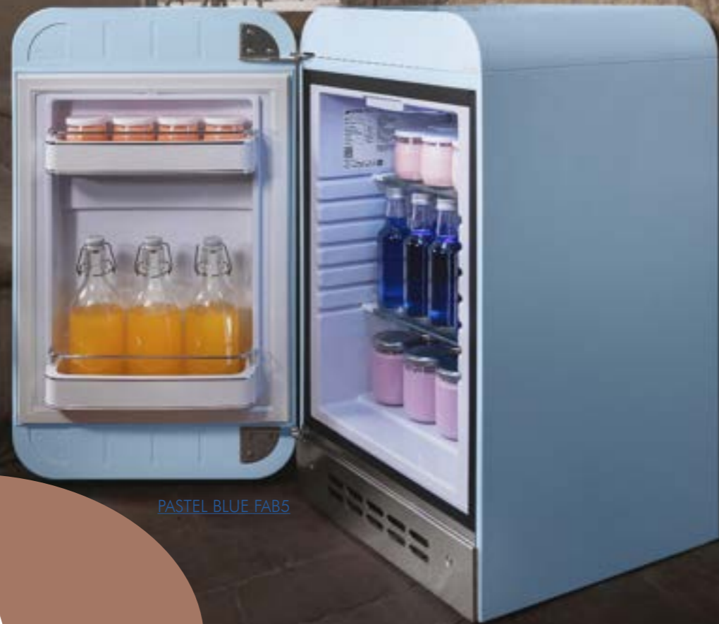
PASTEL BLUE FAB5

Perfectly pair your kitchen appliances 'with the essence of cacao, chocolate and coffee' as this 'sophisticated brown offers an everyday escape, a well-deserved treat. '