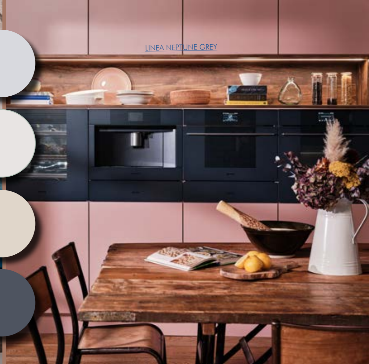
LINEA NEPTUNE GREY