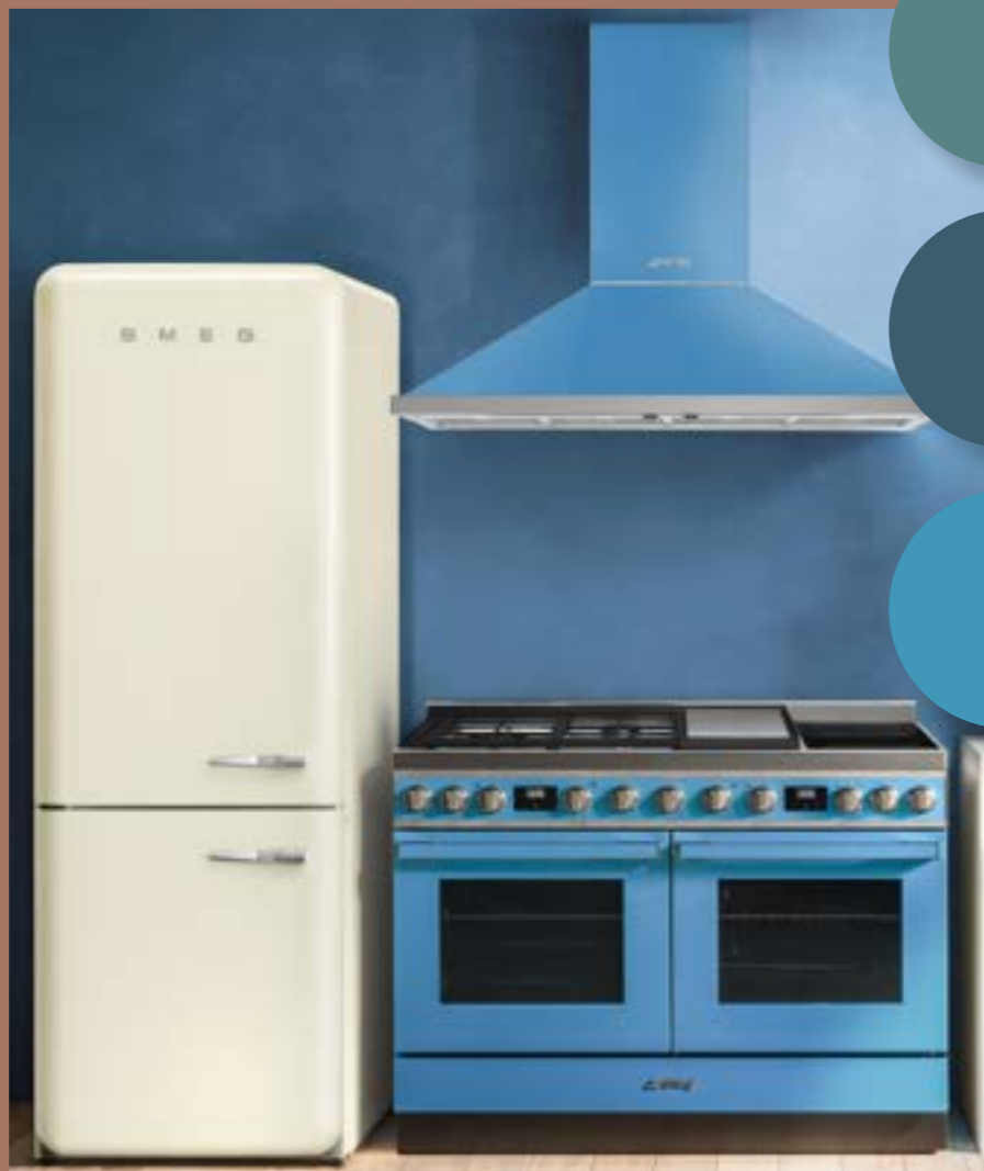
BLUE PORTOFINO RANGE COOKER