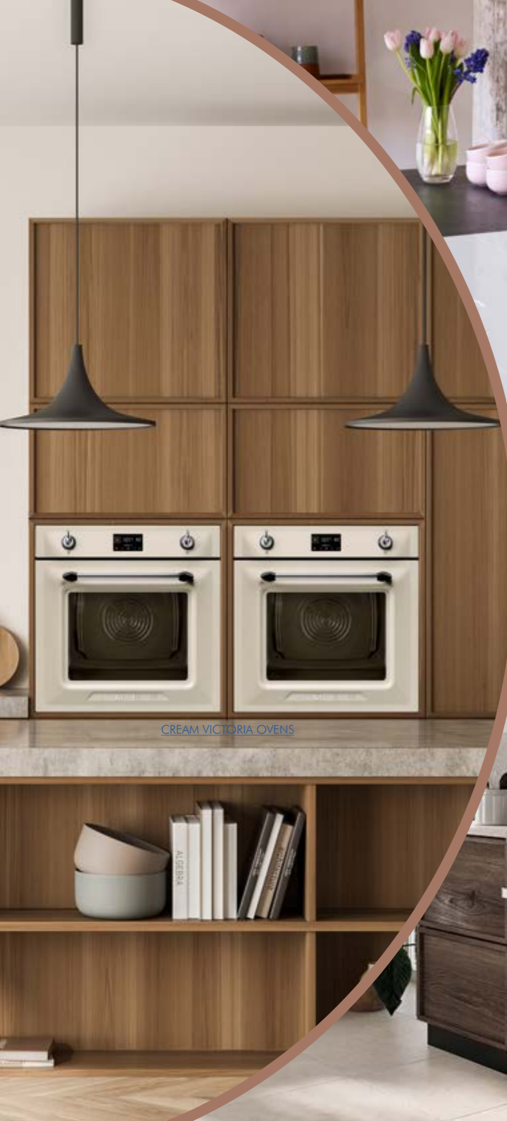
CREAM VICTORIA OVENS