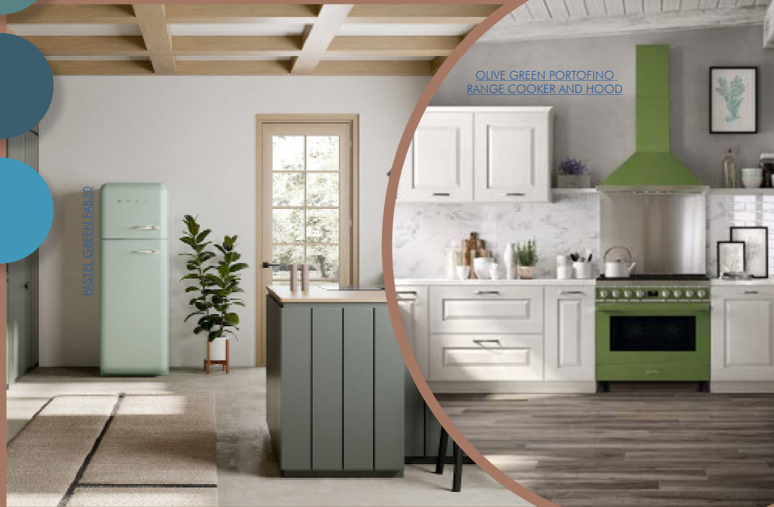
OLIVE GREEN PORTOFINO RANGE COOKER AND HOOD