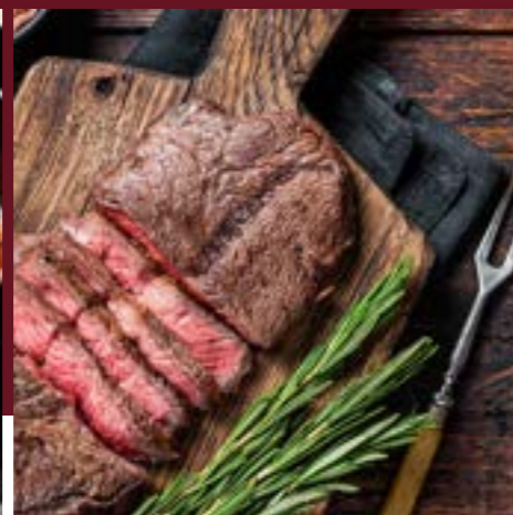
Italian Leg Of Lamb Recipe