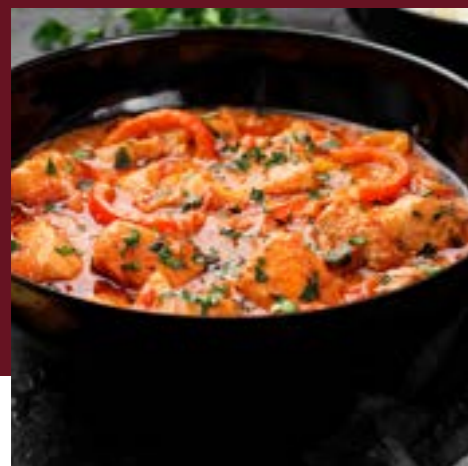
Fish Curry Recipe

Available in 45cm Linea Neptune Grey and Pure Black, along with Dolce Stil Novo.