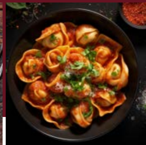
Squash and Sundried Tomato Tortellini Recipe